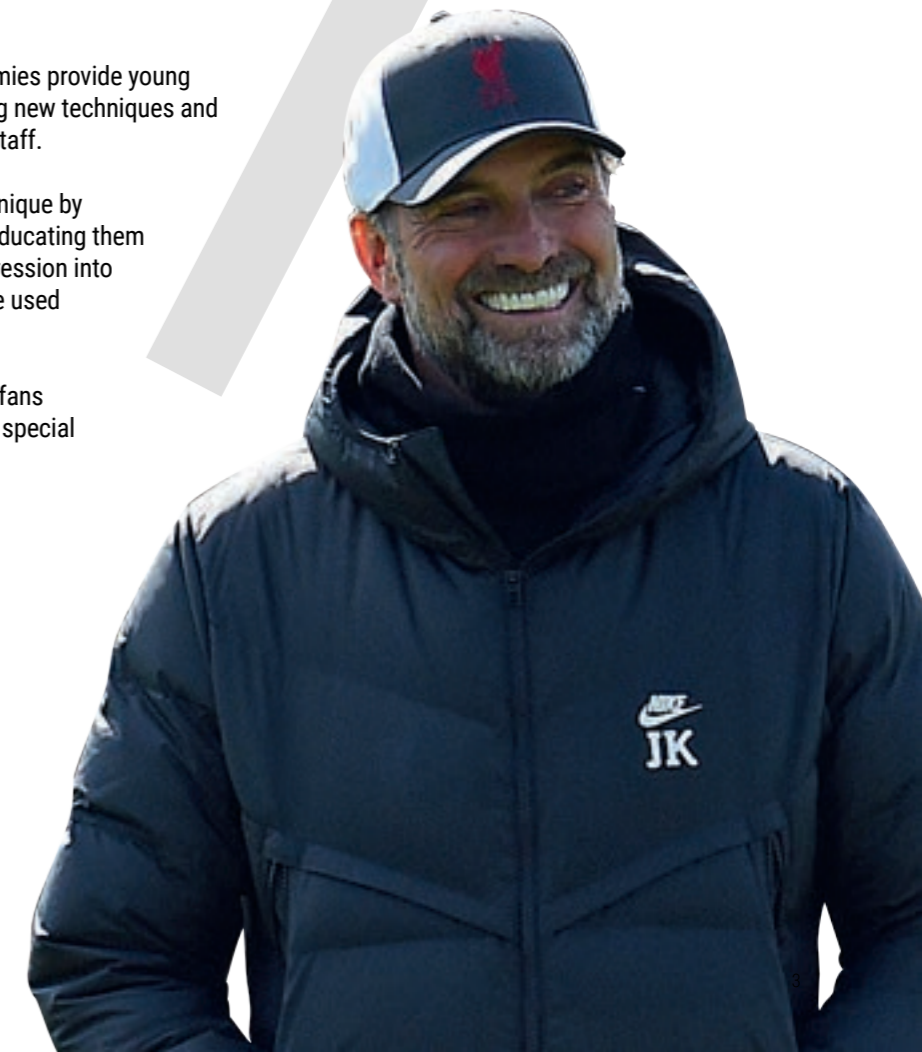
Jürgen Klopp, Manager

A stylized, handwritten signature in black ink, representing Jürgen Klopp.